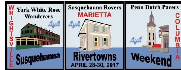
Three separate "B" Award Patches - One for each walking event.

Sponsored by the Penn Dutch Pacers, York White Rose Wanderers & Susquehanna Rovers.